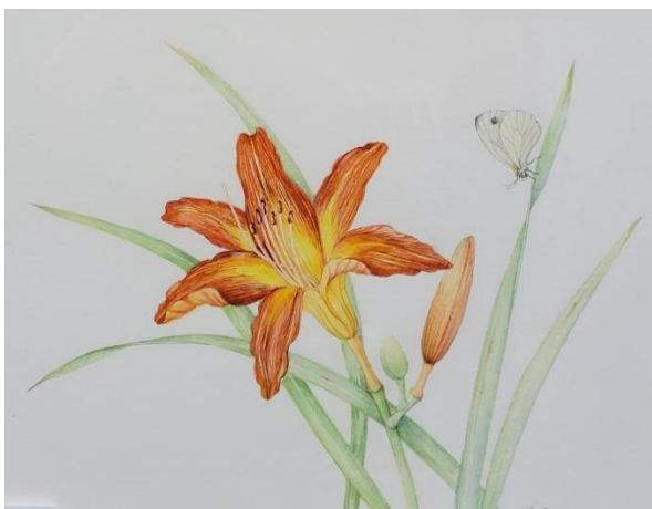
Donna Souren, "Vibrant Day Lily"

https://www.hunterdonartmuseum.org/exhibitions/claybash/